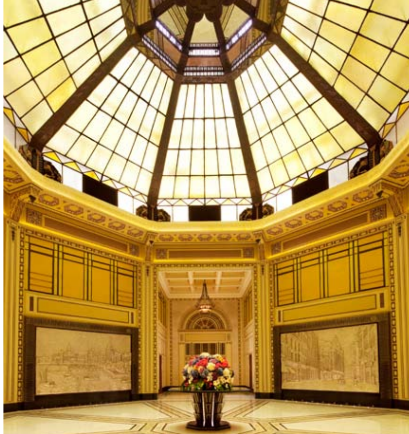
The Masonic Hotel (left) is Napier's largest Art Deco hotel